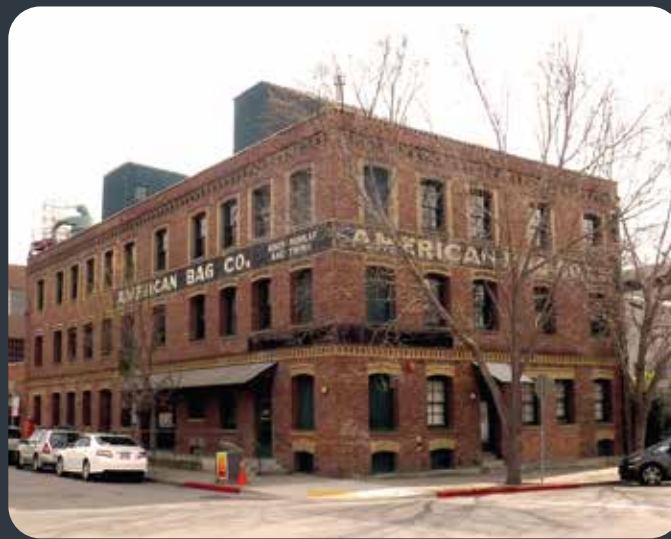
Former American Bag Co. Headquarters 3rd & Harrison.

The historic Waterfront Warehouse District is distinguished by its concentration of well-preserved industrial warehouses constructed during the period 1914 to 1954. The Warehouse District developed around the old Western Pacific spur line and freight depot at 3rd and Harrison Streets, and grew to be a major distribution hub for the wholesale food and grocery industry. The buildings are characterized by their early 20th century utilitarian architecture and house a variety of uses today. Check out the informational placards posted on trash bins around the district to learn more.